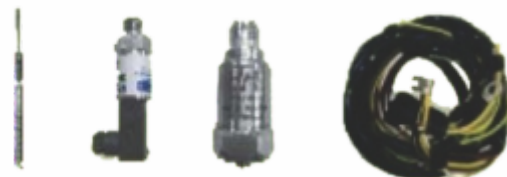
Thermocouple, Pressure Transmitter VIB Sensor, Wiring Harness